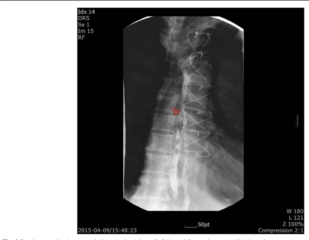
Fig. 2 Esophagography. A contrast leakage in the right wall of the middle esophagus is visible (arrow)