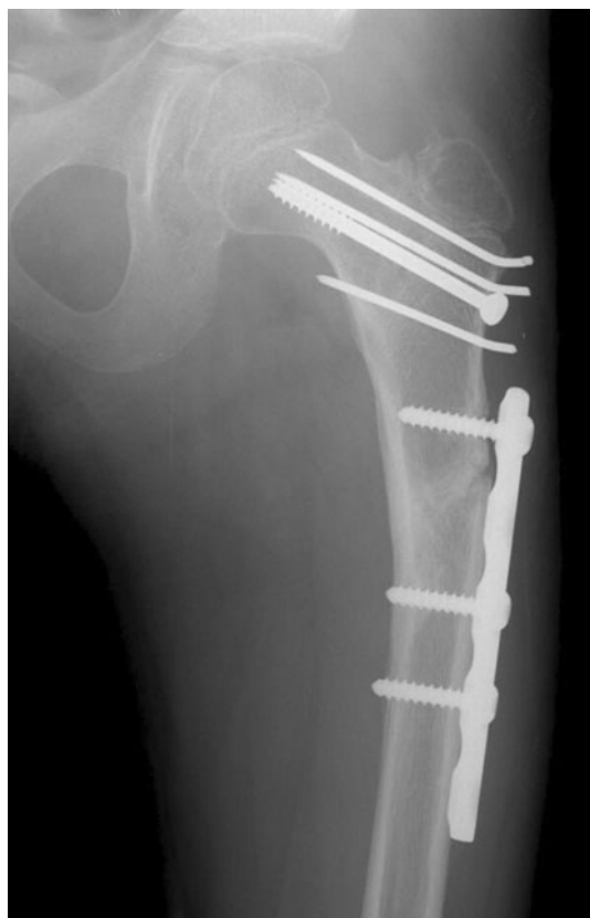
Fig. 4 After removing the cast at two months postoperatively, the radiograph showed a 10° varus deformity of the subtrochanteric fracture with proximal screw back-out