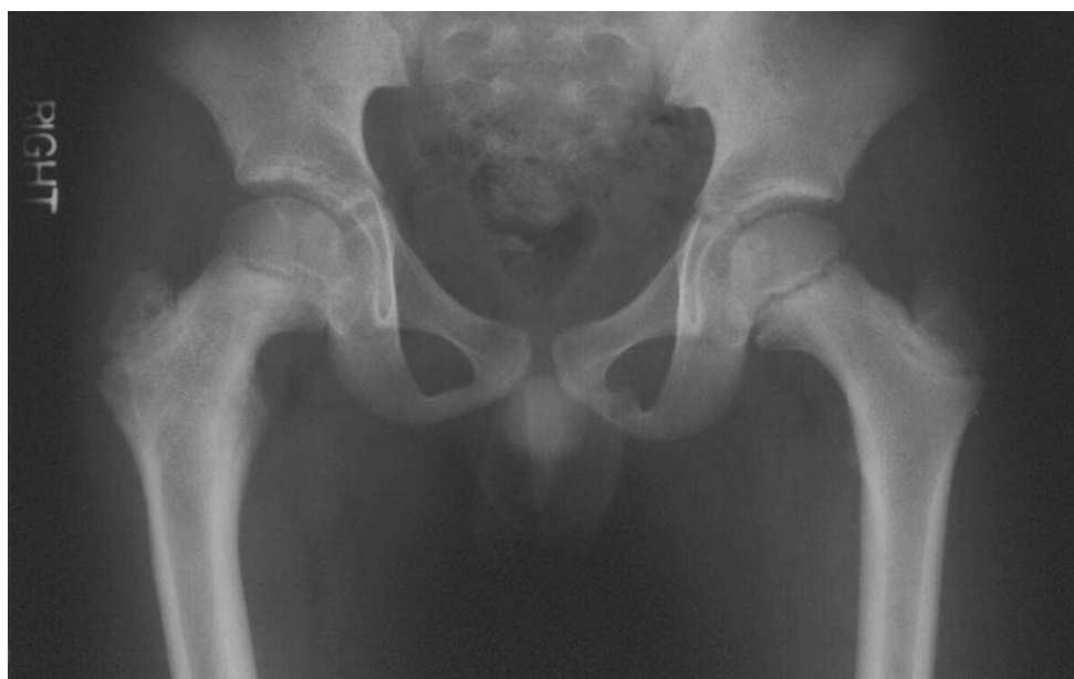
Fig. 8 At two-year follow up, radiographs show union of the femoral neck fracture without avascular necrosis of the femoral head

In this study, we have reported an additional five cases (two from our experience and three more reports found in the literature). The type of fracture neck femur was transepiphyseal (Delbet type I; AO epiphyseal type I) in two cases, cervicotrochanteric (Delbet type III; AO type II) in two cases, and intertrochanteric (Delbet type IV; AO type III) in one case. If all fourteen cases are considered together, the most common type of femoral neck fracture, when associated with ipsilateral femoral shaft injury, is Delbet type III (AO type II) fracture (eight cases).