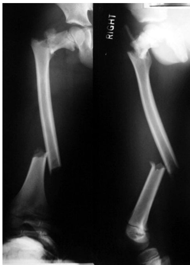
Fig. 6 Boy seven years and ten months of age: anteroposterior and lateral radiographs reveal a right intertrochanteric fracture (type IV in Delbet's classification; AO classification type III) and an ipsilateral lower one-third fracture of the femoral shaft

radiographs revealed that there was no avascular necrosis, but an overgrowth of 1.5 cm was noted (Figs. 8, 9). The patient walked with a limping gait as a sequela of the subdural brain hemorrhage, leg length discrepancy, and unrecovered peroneal nerve palsy.