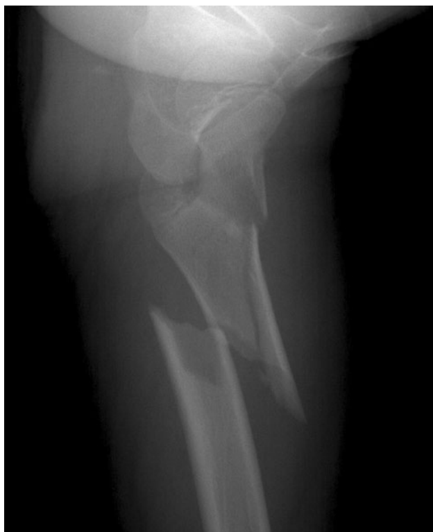
Fig. 2 Eight-year-old girl: lateral radiographs reveal a cervicotrochanteric fracture (type III in Delbet's classification; AO classification type II) with a subtrochanteric fracture of the left femur

and application of the plate. Although the subtrochanteric fracture was fixed with a five-hole compression plate, the proximal fragment was fixed with a single screw to avoid impingement during fixation of the femoral neck fracture. The bone-holding forceps were retained until closed reduction and fixation of the femoral neck fracture had been achieved with a single cannulated screw 3.5 mm in diameter and three Steinmann pins 2 mm in diameter (Fig. 3). Postoperatively, the child was immobilized in a one-and-a-half hip spica cast (hip flexion 30° and abduction 40° for both hips, and knee flexion 30° for the affected limb) to augment the stability of the subtrochanteric fracture fixation. However, after removal of the cast at two months postoperatively, the radiograph showed a 10° varus deformity of the subtrochanteric fracture with proximal screw back-out (Fig. 4). We started non-weight-bearing mobilization exercises at two months and three weeks postoperatively. Walking exercises were started with an ischial weight-bearing long leg brace four months postoperatively, progressing to full weight bearing by five months. Implant removal was performed 11 months postoperatively. Follow-up at five years after the injury showed normal and painless hip function clinically; radiographs showed no evidence of avascular necrosis of the femoral head or growth disturbance, except for the residual 10° varus deformity at the subtrochanteric level in the femur (Fig. 5).