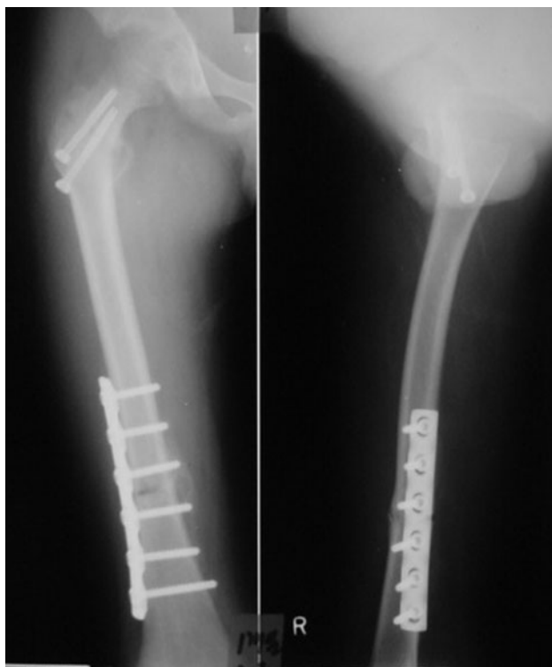
Fig. 7 At six weeks after the operation, the radiographs show well-maintained reduction. The patient was started on non-weight-bearing active exercises

additional reports that we found in the literature but were missed by Agarwal et al. [1]; two were published in the English literature in 1983 and 2006, respectively [9, 10],