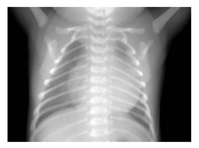
Fig. 2. On admission, chest radiography demonstrated cardiomegaly and clear lung fields (CT ratio: 0.73).

(fraction shortening, FS, 10.8%) and grade I mitral regurgitation. Other cardiac malformation was not showed. We had diagnosed the IVNC with heart failure. Continuous electrocardiographic monitoring and treatment for heart failure using inotropics and diuretics were started.