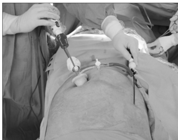
Fig. 1. External view of needlescopic grasper assisted SILC (nSILC) procedure.

All patients were treated by the same surgeon.