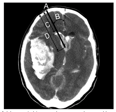
Fig. 1. Axial computed tomography scan used as a guidance image showing ideal catheter location. The image provides information about the entrance point (A) located by the distance measured from the midline to the orbital roof, the angle between the catheter trajectory and the mid-sagittal plane (B), the depth of catheter insertion from the skull to the ventricular wall (C), and the depth of the catheter insertion from the skull to the foramen of Monro (D).

The following technique described by Friedman and Vries<sup>4</sup>) was used. The location for the twist drill hole and point of insertion of the ventricular catheter was the junction of the coronal suture and a parasagittal plane passing through the pupil of the ipsilateral eye. From this site, the ventricular catheter insertion was directed towards the medial canthus of the ipsilateral eye, and maintained in the coronal plane that passes through the external auditory meatus. This trajectory leads to the foramen of Monro. The catheter was passed 6 cm from the outer table of the cranium to cannulate the frontal horn and then tunneled beneath the scalp.