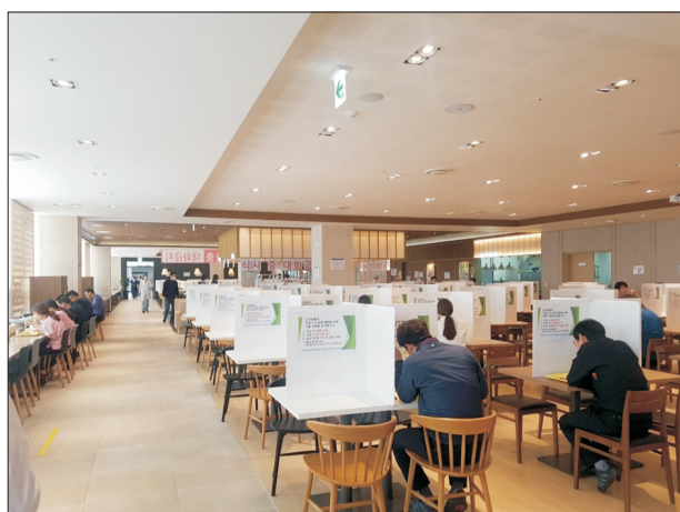
Fig. 3. Employee cafeteria with temporary barriers on the tables to prevent the spread of the virus among employees.