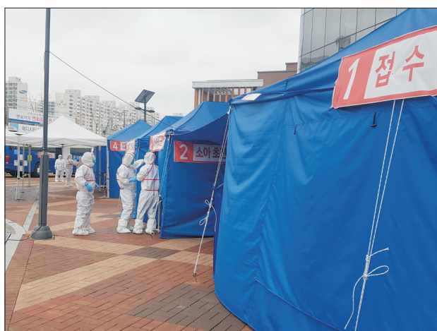
Fig. 1. Medical staffs prepared a screening clinic early in the morning.