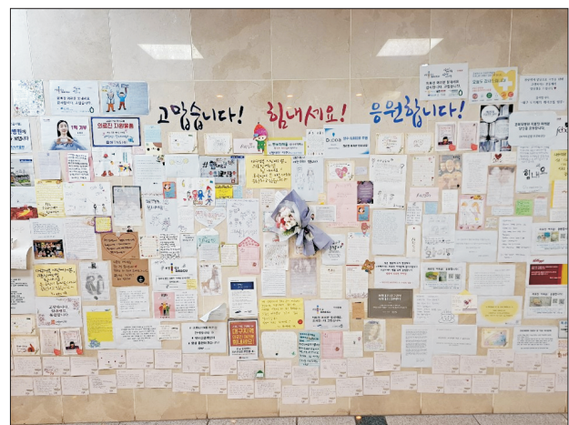
Fig. 5. Letters of encouragement from patients posted on the wall of a hospital in Daegu.