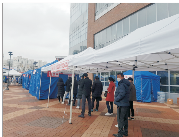
Fig. 2. Patients waited in front of the screening clinic prior to outpatient visits.

Many factors formed the basis for us to overcome the epidemic in Daegu. First, mature citizenship played a piv-