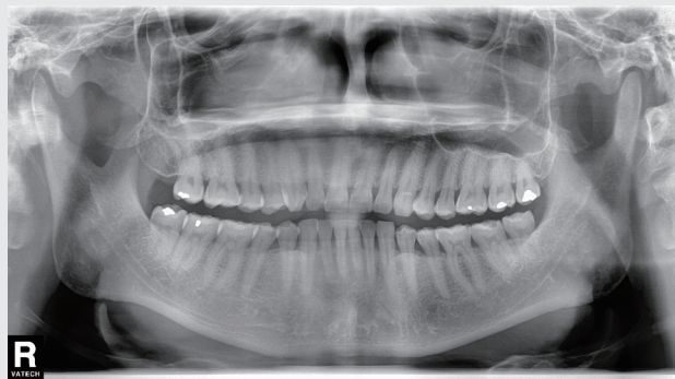
Fig. 1. Radiographic findings: no definite radiographic abnormalities except suspicious haziness of right maxillary sinus.

Febrile and chilling sensations, nausea and a severe headache developed 3 days later, so the patient visited the emergency room and was hospitalized for further