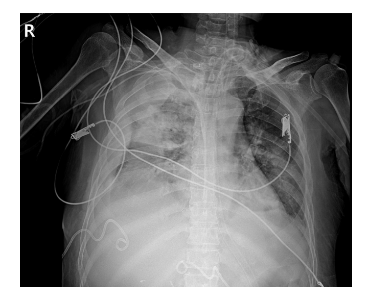
Figure 2 Portable chest radiography approximately 20 min after percutaneous catheter removal shows increased opacification of right hemithorax, and fluid is seen tracking up the lateral margin of the thorax.

mmHg) 15 min after the drainage catheter was removed. Hemothorax was identified on chest radiography (Figure 2). However, there was no active bleeding at the removal site of skin. And hypotension and aggravated tachycardia persisted. Therefore, we immediately performed thoracic aortography and identified active bleeding from the 7<sup>th</sup> right intercostal artery. After super-selection of feeding arteries using a microcatheter, embolization was performed using gelfoam and microcoils. Hypotension persisted even while resuscitation was continued during the procedure. Recovery from hypotension occurred immediately after embolization (Figure 3). A 28-F chest tube was carefully inserted beneath the injured area at a different intercostal space, and 2540 cm3 of fluids was drained (Figure 4). Total transfused RBC were eight packs, and there was no bleeding thereafter.