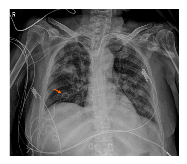
Figure 1 Portable chest radiography shows percutaneous catheter drainage for pleural effusion drain.

Park C et al. Hemothorax due to intercostal arterial bleeding