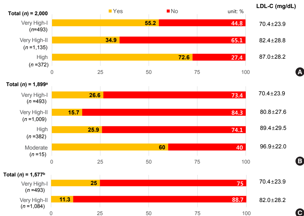
Fig. 2. Low-density lipoprotein cholesterol (LDL-C) target achievement rates according to recent guidelines. (A) LDL-C target achievement rates according to Korean Diabetes Association (KDA) 2019 guidelines. (B) LDL-C target achievement according to European Society of Cardiology (ESC)/European Atherosclerosis Society (EAS) 2019 guidelines. (C) Lipid-lowering treatment pattern according to American Diabetes Association (ADA) 2019 guidelines. (A, B) 'Yes' indicates the portion of patients who meet the target goal and (C) 'Yes' denotes the portion of patients who received recommended lipid-lowering treatment, high-intensity statin or statin combined with ezetimibe. a 101 patients out of the total 1,899 subjects were excluded since their cardiovascular (CV) risk was not clearly determined due to missing body mass index data, b The treatment pattern for patient groups with very-high CV risk was reported selectively. Others are heterogeneous and are reported in Supplementary Table 1.

Based on ADA 2019 guidelines, high-intensity statin or statin plus ezetimibe combination therapy is recommended for use in patients with established ASCVD (Very High-I), or patients over 40 years with TOD or any CV risk factor (Very High-II). The mean LDL-C for 493 patients in the Very High-I group was 70.4 mg/dL; mean LDL-C for 1,084 patients in the Very High-II group was 82.0 mg/dL. Only 25.0% of Very High-I group and 11.3% of Very High-II group patients were treated with high-intensity statins or statins plus ezetimibe therapy (Fig. 2C).