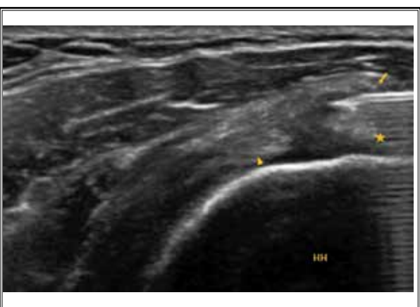
Fig. 2. Transverse ultrasound view of the RI approach injection. The needle tip (arrow) is positioned in the RI between the long biceps tendon (arrow head) and the subscapularis tendon (asterisk).

tendon for visualization of the IA course between the supraspinatus and subscapularis tendons. The needle was introduced medially to laterally with visualization of the needle shaft, and reached the RI between the long biceps tendon and the subscapularis tendon (Fig. 2) (10). The PC approach injection was performed with the patient in the semilateral decubitus position on the unaffected side with 45° anterior tilting of the affected side. The needle was advanced laterally to medially with visualization of the needle shaft under US guidance, and reached the GH joint space between the posterior humeral head and glenoid labrum. Once the needle had made contact with the humeral head, the needle was slightly withdrawn and followed by administration of the injection mixture in a resistance-free position (Fig. 3) (6,14). All procedures were performed by a single shoulder-intervention specialist (DHK) with 15 years of experience in the field. After the injection, anteroposterior and axillary fluoroscopic images were