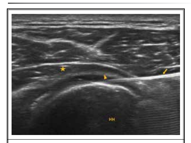
Fig. 3. Transverse ultrasound view of the PC approach injection. The needle tip (arrow) is positioned in the PC (arrow head) of GH joint under the infraspinatus tendon (asterisk).

All pretreatment and follow-up assessments were performed by the same evaluator, who did not participate in administration of treatment. Pain intensity using the Visual Analog Scale (VAS) score, the American Shoulder and Elbow Surgeons (ASES) score, the subjective shoulder value (SSV), and passive ROMs was assessed prospectively before the injection and at 3, 6, and 12 weeks after the injection. A goniometer was used for assessment of the ROMs, which included