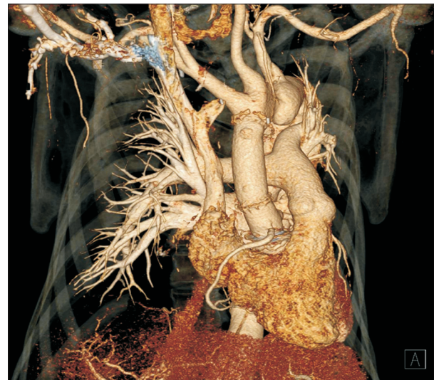
Fig. 3. Postoperative computed tomography angiography shows 2 well-enhancing separate coronary arteries and the absence of the root aneurysm.

perfusion through the innominate artery was maintained during total circulatory arrest (TCA). Hemi-arch replacement was performed using a 24-mm Gelweave 1-branched graft (Vascutek, Inchinnan, UK). After completing distal aortic anastomosis, cardiopulmonary bypass was restarted using the branched graft as an arterial inflow site. The patient was subsequently rewarmed. After removing the old graft and mechanical valve, which contained a thrombus and subvalvular pannus, the coronary arteries and aneurysms were examined. Since the aneurysmal change was in the common coronary button, the anomalous RCA had sufficient length for a separate anastomosis, excluding the stenotic intramural ostium. A 23-mm composite valve conduit (St. Jude Medical Inc., St. Paul, MN, USA) was used for the modified Bentall procedure. The left coronary button was prepared and anastomosed to the prosthetic com-