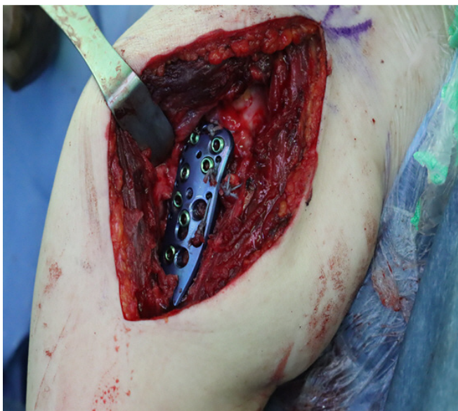
Fig. 2. Intraoperative photograph shows internal fixation in right humerus.

Eisenmenger syndrome is a pulmonary vascular disease in which a large amount of blood flows into the pulmonary artery due to congenital heart diseases such as uncorrected ventricular septal defect, ASD, or patent ductus arteriosus, subsequently thickening or obstructing the wall of the pulmonary artery [7]. In these patients, a left-to-right shunt due to ASD increases blood flow to the pulmonary artery and PVR, resulting in pulmonary hypertension. Over several decades, hypertrophy of the right atrium and RV with shunt reversal eventually leads to right-sided heart failure and bidirectional shunts. This results in a systemic hypoxic state with symp-