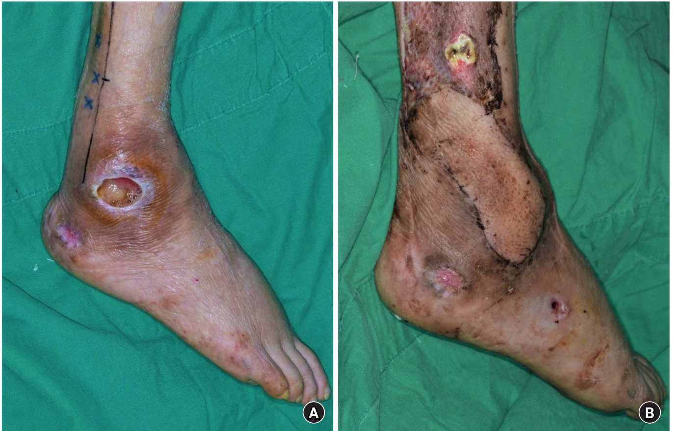
Fig. 2. A 59-year-old man with a 3×2 cm chronic wound on the lateral malleolus due to infective bursitis underwent treatment with a peroneal artery perforator-based propeller flap (A). (B) Four weeks postoperative.