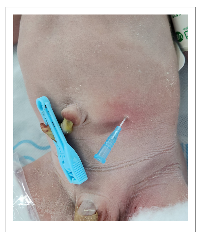
FIGURE 2 Before general anesthesia, a percutaneous 18G angiocatheter was placed in the stomach without imaging guidance, serving as a temporary gastrostomy.

Chest and abdominal radiographs obtained post-orogastric tube insertion demonstrated a coiled orogastric tube (indicated by the yellow arrow) and the double bubble sign (indicated by the orange arrow).