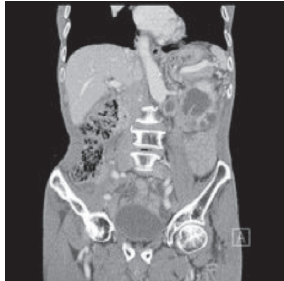
Fig. 2. Later finding on computed tomography. CT scan revealed an 8.8-cm lobulated abscess with septation in the lower pole of the left kidney. No discrete masses were identified in the renal parenchyma.

necrotic para-aortic lymph node at left side of aorta, and renal biopsy was not performed because of easy touch bleeding. Nephroure-terectomy was not underwent because positron emission tomography revealed hypermetabolic lesion suggesting metastasis at the lumbar spine area. The pathologic diagnosis was infiltrating urothelial carcinoma of the renal pelvis (Fig 3, 4).