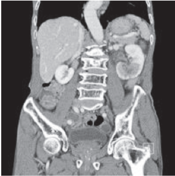
Fig. 1. Initial finding on computed tomography. CT scan revealed left renal pelvis and ureteral wall thickening with enhancement and mild hydronephrosis with multifocal wedge-shaped low enhanced lesions on Lt renal lower pole.