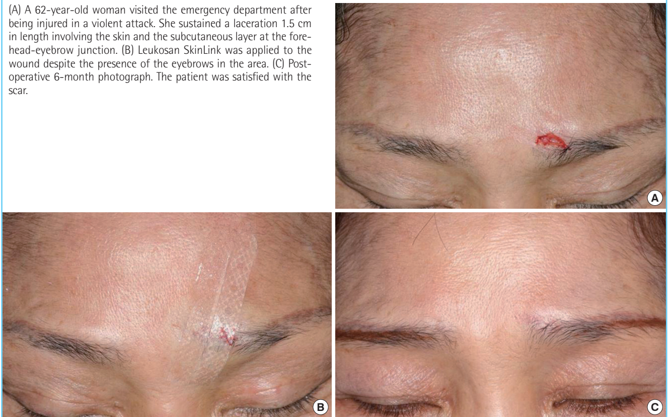
Fig. 4. Patient case II

(A) A 62-year-old woman visited the emergency department after being injured in a violent attack. She sustained a laceration 1.5 cm in length involving the skin and the subcutaneous layer at the forehead-eyebrow junction. (B) Leukosan SkinLink was applied to the wound despite the presence of the eyebrows in the area. (C) Postoperative 6-month photograph. The patient was satisfied with the scar.