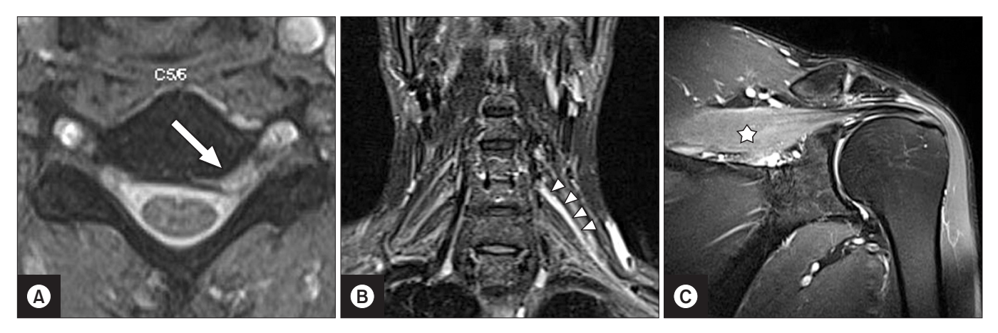
Fig. 1. Images of case 1. (A) C5-6 intervertebral disc herniation (arrow) compressing the left C6 root. (B) High signal intensity (HSI) in the C6 root (arrowheads) on coronal T2 short-tau inversion recovery (STIR) image. (C) HSI in the supraspinatus (asterisk) on coronal T2 STIR image.

SNAP, sensory nerve action potential; CMAP, compound muscle action potential; MRN, magnetic resonance neurography; SSN, suprascapular nerve; AN, axillary nerve; MCN, musculocutaneous nerve; SSP, supraspinatus; ISP, infraspinatus; BB, biceps brachii; BR, brachioradialis; D, deltoid; P, paraspinal muscle.