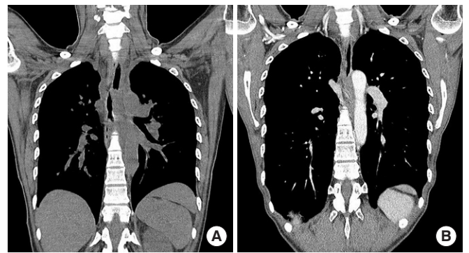
Fig. 3. (A, B) One year follow-up computed tomography scan demonstrated no evidence of inflammation of the neck and mediastinum.

Thyroidectomy is a clean procedure with a very low rate of postop-